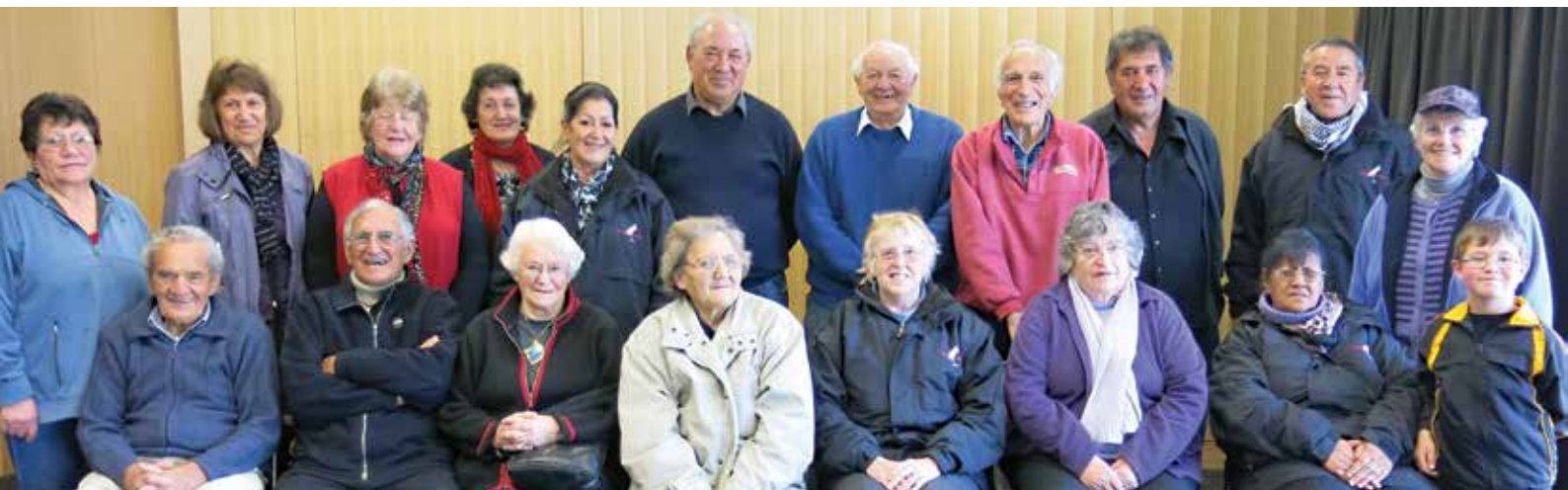
The Rangitane Kaumatua Council has been re-activated.

Our Culture and Language group have completed four Marae based Wananga programmes, attracting members from as far away as Auckland, Wanganui, Wellington and Dunedin. Based at Omaka Marae and Ukaipo. These wananga were designed to introduce our Iwi members to our Waiata, Haka, wahi Tupuna and pakiwaitara that are unique to our rohe. The program was a success and plans are under way to commence the program again over the summer season.